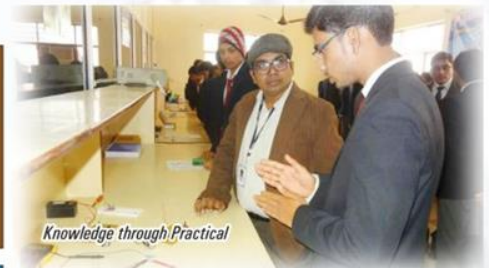
Knowledge through Practical