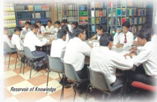
Reservoir of Knowledge