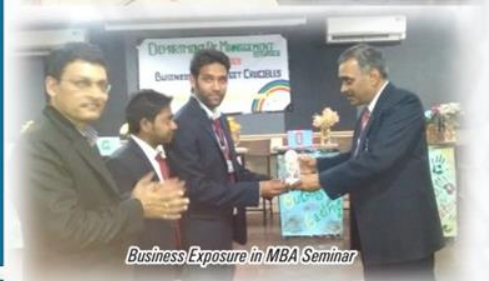
Business Exposure in MBA Seminar