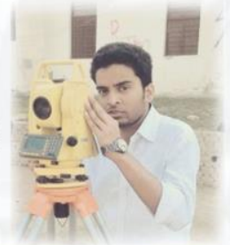
Facing realities of life through Civil Projects