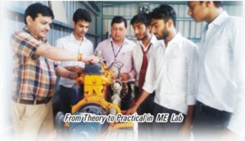
From Theory to Practical in ME Lab