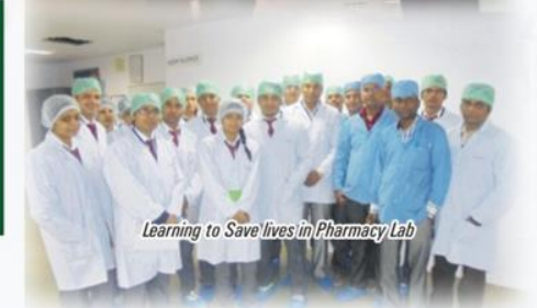
Learning to Save lives in Pharmacy Lab